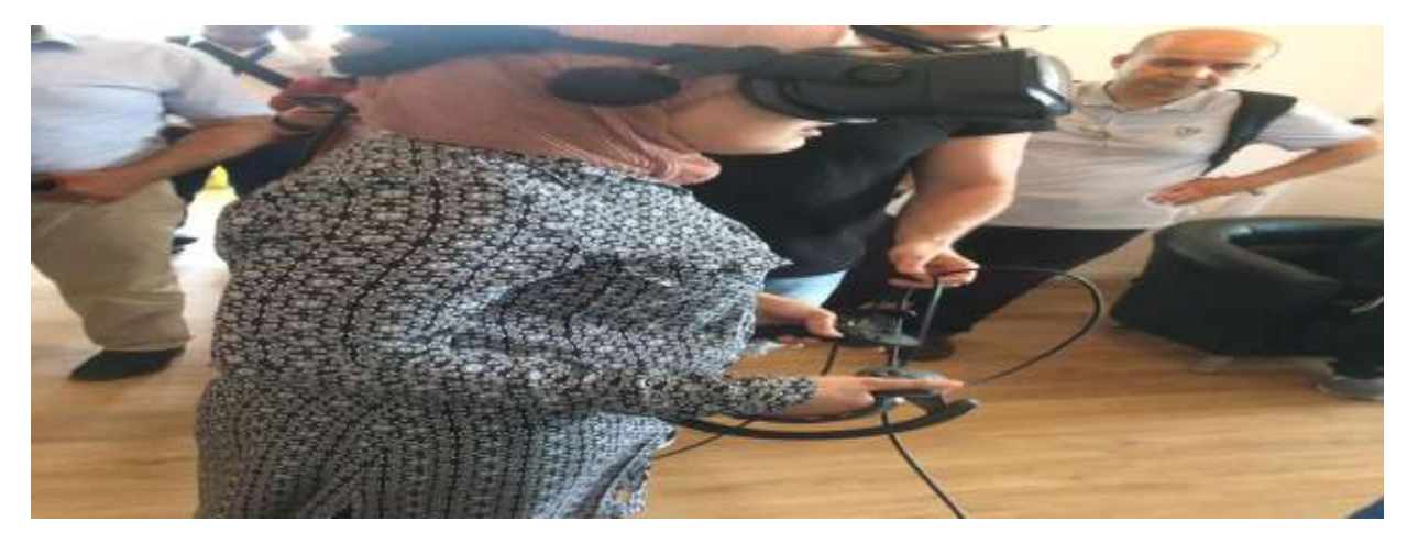
HTWK Leipzig - Germany